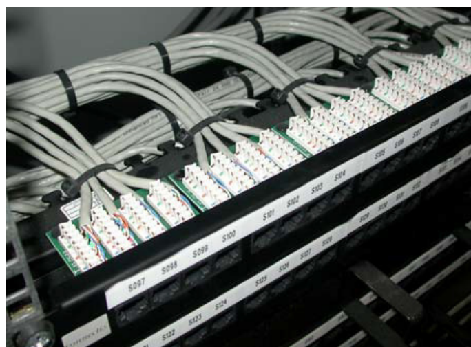
2020 Patch Panel installed at Kedleston Road.